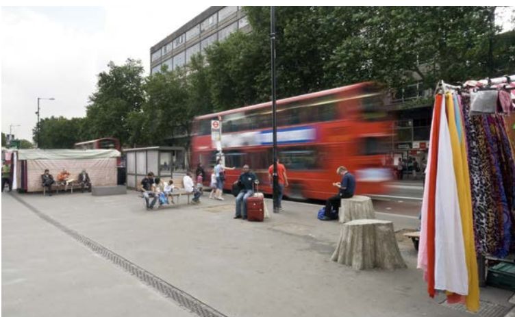
Webber Street, LB Southwark (L)

People will feel more relaxed if streets are clean, well maintained and free of litter.